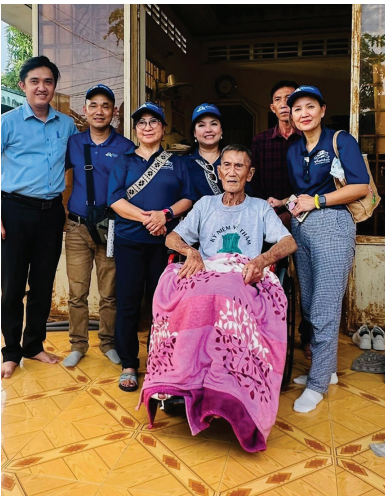
A joyous photo of an elderly in Mỹ Tho, who was on the waiting list for two years.