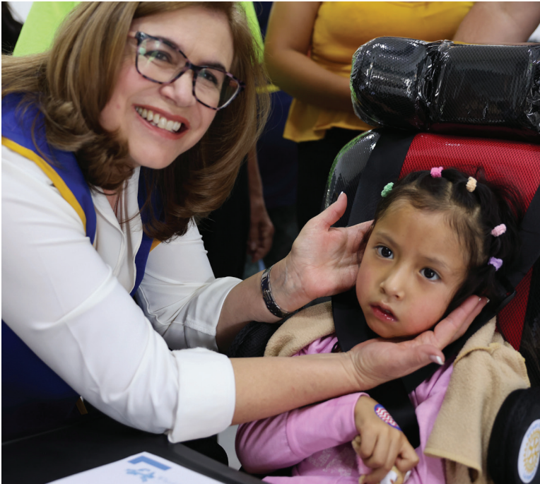
Joyful moment with a young recipient.