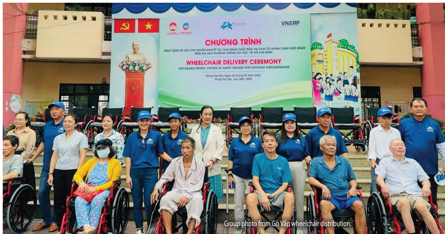
Group photo from Gò Vấp wheelchair distribution.