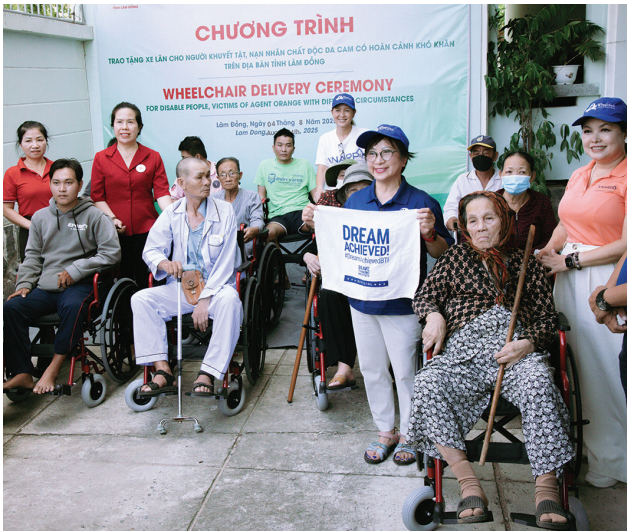
Final group photo at Phan Thiết, Lâm Đồng Red Cross.