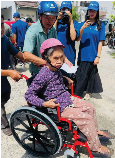
A touching photo of elderly in Phan Thiết.