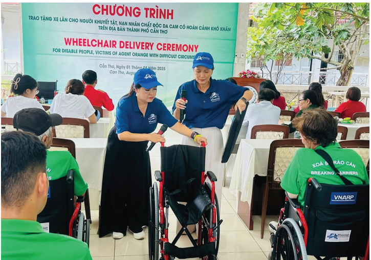
Warm scenes at Cần Thơ senior center.