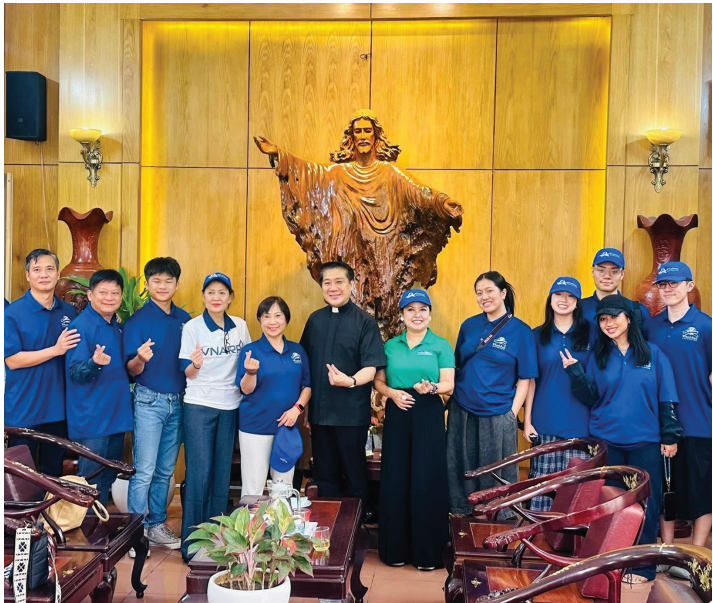
Parish gathering in Xuân Lộc, Đồng Nai.