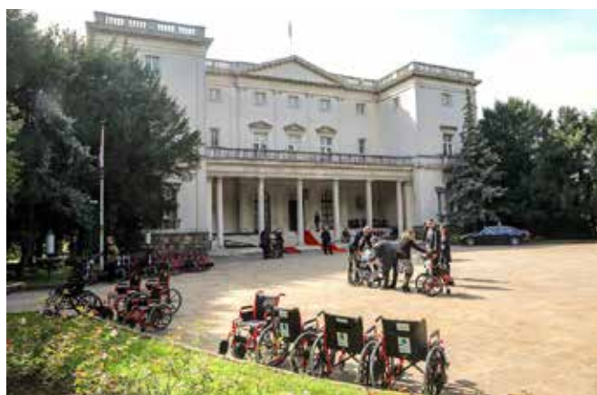
FROM TOP : >>> Their Royal Highnesses Crown Prince Alexander and Crown Princess Katherine with American delegation donating wheelchairs at the White Palace . >>> The White Palace provides a beautiful background for our distribution. >>> HRH Princess Katherine greets recipients and their families receiving wheelchairs. >>>