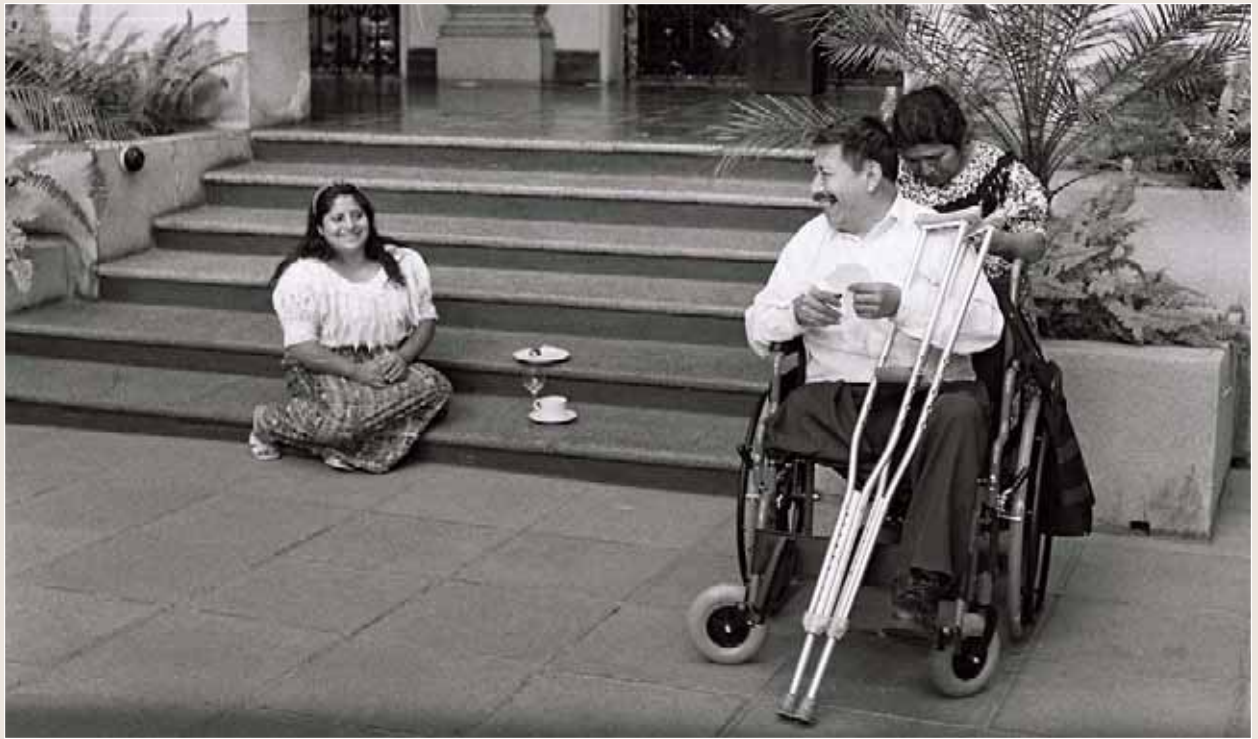
CLOCKWISE FROM TOP: >>> This man happily exchanges his crutches for a wheelchair >>> New-found mobility brings happy smiles >>> A Rotarian helps this Cambodian woman familiarize herself with the new wheelchair