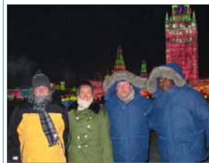
ENJOYING THE HARBIN ICE FESTIVAL