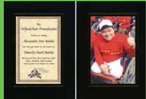
Sample Presentation Folder

EACH $75 DONATION WILL DELIVER A WHEELCHAIR AND GREATLY IMPROVE THE QUALITY OF LIFE FOR A CHILD, TEEN OR ADULT WITHOUT MOBILITY. YOU WILL RECEIVE A BEAUTIFUL CERTIFICATE OF THANKS WITH A PICTURE OF A WHEELCHAIR RECIPIENT IN YOUR NAME OR DEDICATED TO YOUR LOVED ONE. YOU WILL ALSO RECEIVE A FREE COPY OF ROAD TO PURPOSE. DONATE TWO WHEELCHAIRS AND RECEIVE A SIGNED COPY.