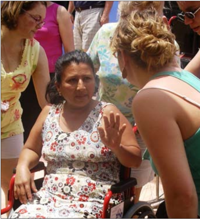
Above: >>> Volunteers listen and learn about the plight of people with disabilities in the State of Cancun, Mexico. >>>