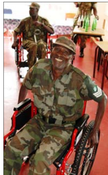
Above: >>> A first wheelchair for this soldier at the Mubende Barracks in western Uganda. >>> Left: Soldiers assist wheelchair recipients at a Knights of Columbus Veteran's Day distribution. >>> Below: A parade of wheelchairs, and a testament to the violence faced in the war on narcotics in Colombia, South America. >>>

Wheelchair Foundation also donates wheelchairs to Veterans and wounded warriors abroad. Whether assisting the wounded men and women who fight the war on the illegal cocoa trade in Colombia, South America, or the victims of landmine tragedy and civil war in Angola, or those dealing with the lingering effects of conflicts past in places like Cambodia, Laos and Vietnam in Asia, we offer our assistance in the form of wheelchairs. In arenas such as Afghanistan and Iraq, we have provided wheelchairs for U.S. troops to distribute to wounded Afghan and Iraqi citizens and fighters alike, thus empowering our service men and women to assist those who fight side by side with them. And we continue to assist ongoing U.S. Military international outreach programs like "Operation Continuing Promise" by making wheelchairs available to hospital ships like the USNS Comfort and the USS Iwo Jima.