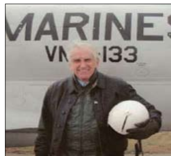
>>>Full Colonel, Marine Pilot, Tonight Show sidekick, Wheelchair Foundation supporter Ed McMahon. >>>

Recently, the USNS Comfort hospital ship spent four months at sea providing medical treatment to over 100,000 patients in Haiti, the Dominican Republic, Antigua and Barbuda, Colombia, Panama, El Salvador, and Nicaragua, spending 10 to 12 days in each port. During the course of the deployment medical teams completed 1,657 surgeries, dispensed 193,961 prescriptions, 30,785 pairs of glasses and 11,940 pairs of sunglasses, extracted 4,444 teeth and provided wheelchairs to people in need of mobility.