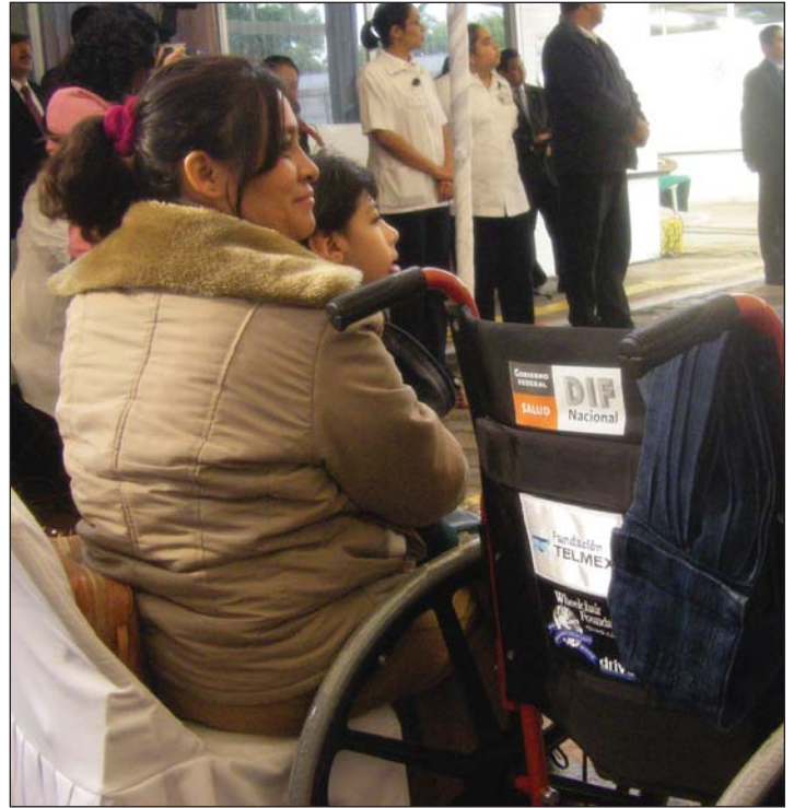
A mother and her son receive a new wheelchair courtesy of Telmex.