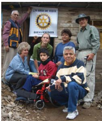
Rotarians in action.

In order to maximize the potential of contributions made by Rotarians worldwide, The Rotary Foundation of Rotary International (TRF) allows for eight Matching Grant opportunities with any outside organization acting as a cooperating organization. Wheelchair Foundation is pleased to be able to help Rotarian donors maximize the potential of contributions by coordinating this participation.