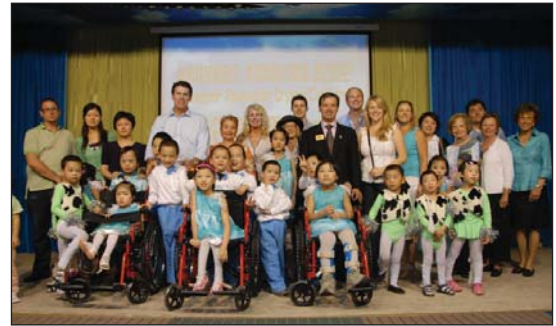
The Crystal Cathedral team at the Tianjin Institute of Children's Welfare.