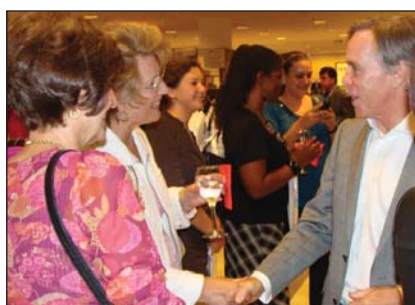
Tommy Hilfiger mingles at the Wheelchair Foundation private reception.

On September 17th, fashion designer Tommy Hilfiger came out to Stoneridge Mall in Pleasanton, CA to showcase his new fashion line. He partnered with the Wheelchair Foundation by donating 5% of his event proceeds back to us! Wheelchair Foundation attendees were honored with a private cocktail reception and personal meet-and-greet with Tommy Hilfiger.