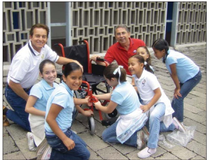
Rotarians, businessmen and students all work together preparing wheelchairs for recipients in Peru.