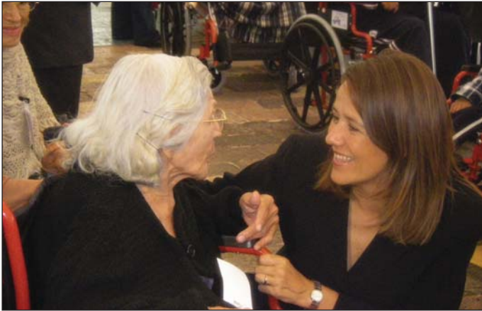
First Lady of Mexico, Margarita Zavala de Calderon

Mobilize Mexico with a Donation of 15,000 Wheelchairs