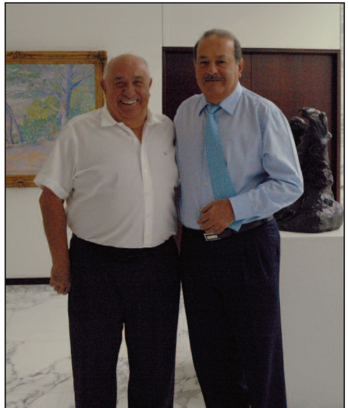
WHEELCHAIR FOUNDATION FOUNDER AND CHAIRMAN OF THE BOARD KENNETH E. BEHRING (LEFT) AND TELMEX CHAIRMAN OF THE BOARD CARLOS SLIM.

Telmex Foundation is committed, and so are Ken Behring and the Wheelchair Foundation!